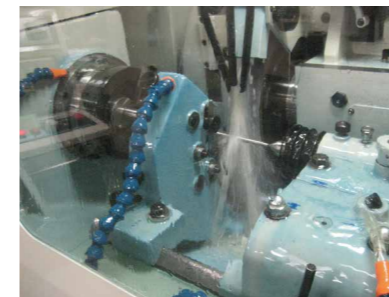
High accurate shaft groove process by Grinding machine

Production procedures vary by accuracy requested from customers. Precision Ball Screws with high accuracy by Grinding process and Rolled Ball Screws with formed groove by Rolling dies (Tooling for Rolling process) can be classified. Generally, C5 or higher grade is manufactured by Grinding process and accuracy of C7, C10 are manufactured by Rolling process. It is also possible to produce C7, C10 by Grinding when Rolling dies do not exist.