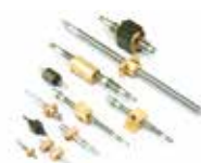
Combination of Shaft dia. & Pitch Unit:mm

***Blank : Can be manufactured, but please inquire KSS.