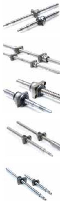
Standard Products in stock Table of Shaft dia. and Lead combination (Model distinction)